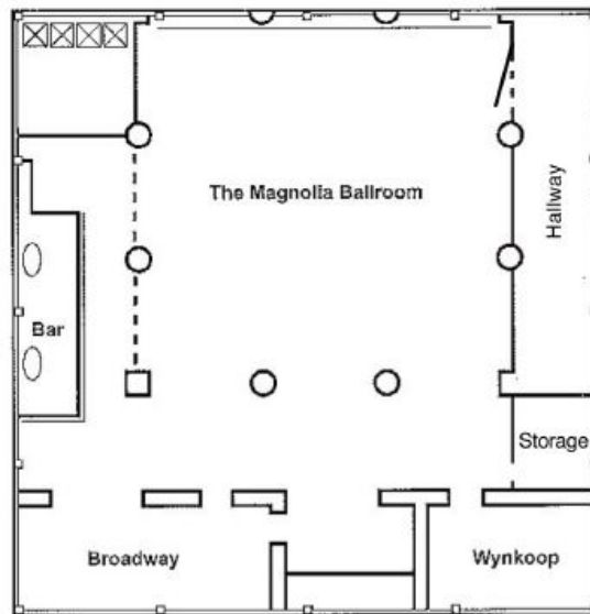
The Magnolia Ballroom 817 17th Street (Right Across 17th Street)